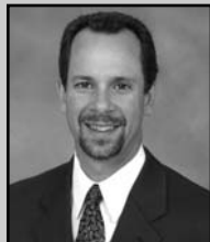
Kyle Kallander Commissioner